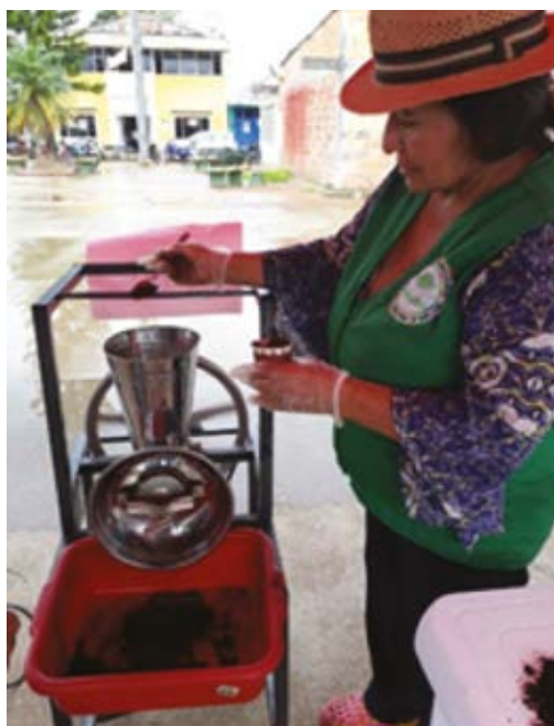
Photo 31: CCoffee producer at a peasant farmers' market