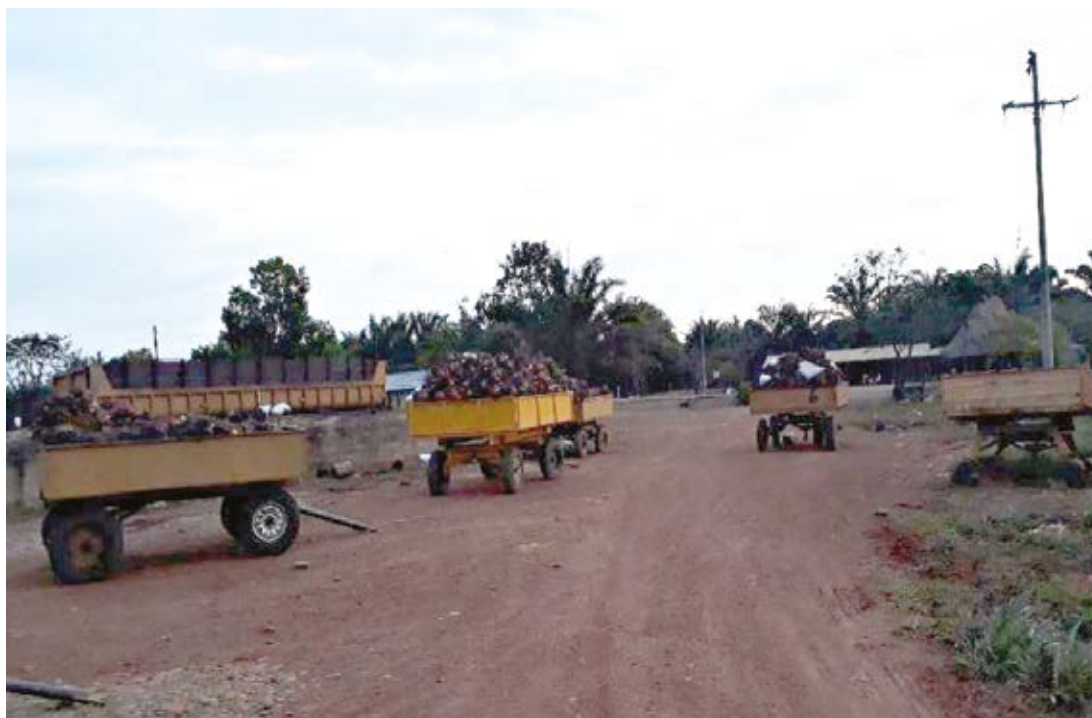
Photo 29: Entrance to the Vereda Chaparrito

The beneficiaries of these awards never took material possession of the land since peasant farmers had already lived there since before 1996. What the new beneficiaries did was to pay no attention to the rights of the farmers, selling the titles to the land to other people (Panfilera on December 12, 2005 with Real Estate Registration 236-38510 in San Martín-Meta; Angosturas II on June 15 of 2007 with Real Estate Registration 236-41167 in San Martín-Meta; and Angosturas I on July 3, 2007 with Real Estate Registration 236-41588).